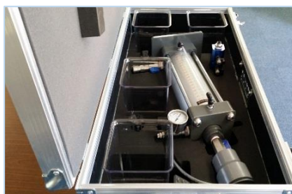
Heavy duty DAF Test Accessories carry case – with handle & wheels