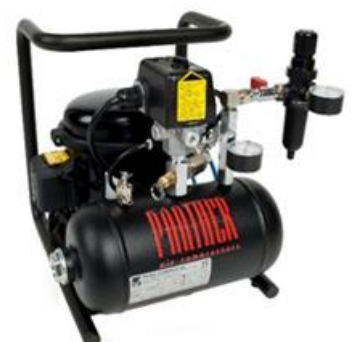
Whisper quiet Air Compressor