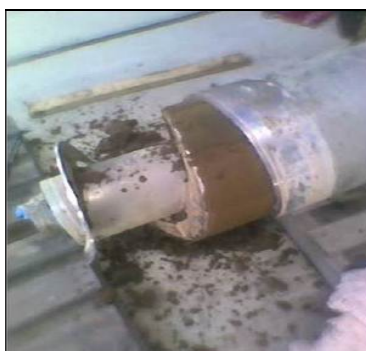
Figure 4: Blocked centrifuge that led to significant period of down-time for the Woodglen WTP washwater system.

The improvements had obvious and significant impacts on cost and time, yet operators were still being frustrated by repetitive blockages and having to spend considerable amounts of normal work time and overtime nursing the centrifuge through its cycles. Soon after the above rectification works were completed, a significant blockage occurred that was not able to be cleared (see Figure 4 below). This led to an extended period of centrifuge downtime.