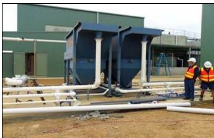
Figure 3: Lamella clarifiers used to process washwater at Woodglen WTP

There was little that could be done about the lamella clarifiers themselves, apart from a complete replacement/augmentation which was not viable at the time. They are purpose built to produce high quality supernatant and were purchased for another treatment project and reused at the Woodglen WTP. The way they were operated was an area that could be improved and was the focus of some of the rectification works detailed below.