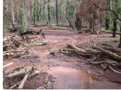
Figure 1: Bushfire impacted catchments, Mitchell and Macalister Rivers.