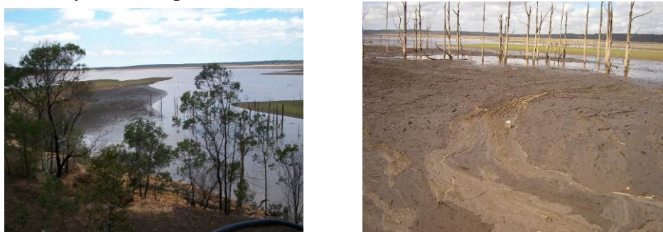
Figure 3: Coongulla raw water offtake buried in mud and debris.

Downstream from Licola, both the Coongulla and Maffra Water treatment plants drew water from the Macalister River. Coongulla was ultimately taken off line as the offtake was inundated by mud and debris.