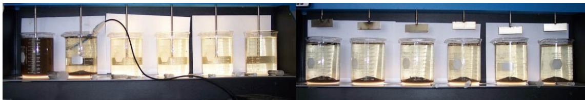
Figure 4: Jar tests on the Macalister River water Licola.

In jar tests of the water, up to 10% was observed as settled sludge, a percentage that the plants existing configuration could not maintain through an extended dirty water event. Ultimately several submersible pumps were placed in the clarifier and programmed to periodically extract sludge, the key selection criteria becoming head pressure capacity.