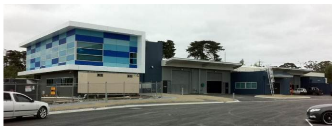
Figure 1: National Water Resource Training Facility at Chisholm's Water Center

The National Water Resource Training Facility, established at the Chisholm Institute Cranbourne Campus has been designed to be a state of the art facility for the training of water and wastewater operators. The Facility provides some leading technologies in the field of water treatment and includes an undercover 36m x 6m sand pit for hands on training in excavation, civil construction skills, trenching, shoring and pipe laying.