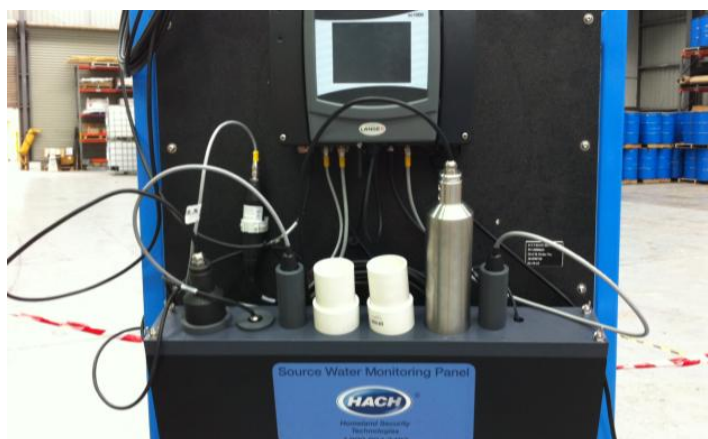
Figure 10: Water Quality Analysis Module

The apparatus is typical of equipment that can be found on many Water Treatment Plants and is capable of monitoring pH, ORP, Conductivity, UV Absorbance, Turbidity and Suspended Solids. All of these are displayed and logged via a multi parameter universal controller.