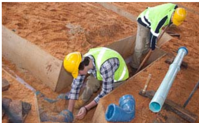
Figure 2: The Sand Pit at the Water Center Chisholm.

Clean TeQ's involvement as the technology partner, was focused on the water technologies including supply of equipment for training relating to sedimentation and clarification, multimedia filtration, submerged ultra-filtration, Ion exchange, Reverse Osmosis and UV sterilization. This facility presented itself as an exciting opportunity for Clean TeQ to provide some leading technologies whilst participating in a worthy installation that has the visionary outlook that recognizes the value of water in all forms within our society.