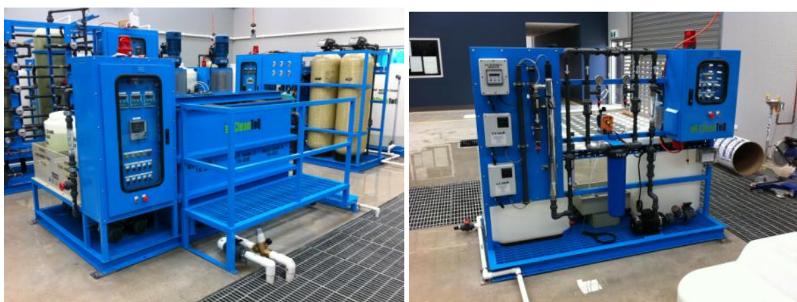
Figure 8: Effluent Neutralisation System & Chlorine Dosing System with UV Sterilisation

The sterilisation module consists of 3 separate processes which include the Effluent Neutralisation System (ENS), the Chlorine Dosing System (CDS) and the Ultra Violet Disinfection System (UVDS). Each of these modules can act independently and provide the trainee with the basic principals required to ensure the correct management of the final stages of water treatment.