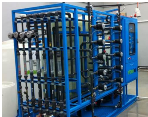
Figure 6: Ion Exchange Module

The ion exchange system utilizes both an anionic and cationic resin bed to produce soft water by exchanging \text{Ca}^{++} and \text{Mg}^{++} ions for \text{Na}^+ or \text{H}^+ ions. Ion exchange is also used for water purification and decontamination. Caustic and acid are used to regenerate the beds and the trainee can learn to use either time or conductivity to initiate this process.