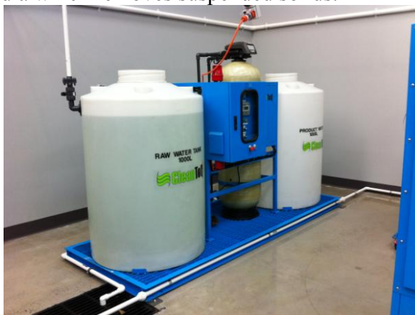
Figure 3: The Activated Filter Media Module

to the bottom of the vessel and allowing the pressurised water to travel up through the glass bead filter media which removes suspended solids.