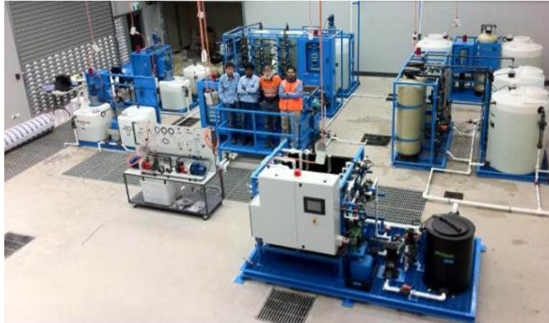
Figure 11: Inside the National Water Resource Training Facility

operator will have many of the skills required to work on any water authority facility around Australian and internationally.