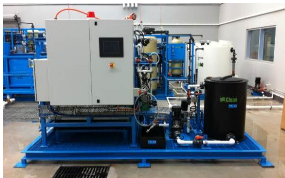
Figure 7: Submerged Ultra-filtration module