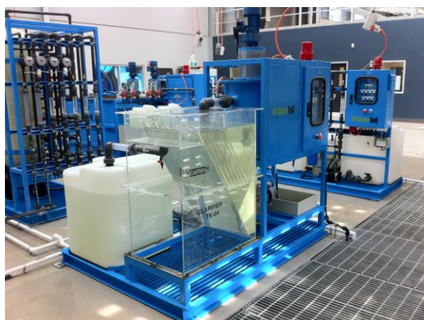
Figure 4: Clarifier, Flocculation and Coagulant Module

The Flocculation and clarification process is used when raw water contains a large amount of fine suspended matter, for example silt or mud, which clog up downstream processes. Flocculent is added to the raw water and gently mixed to encourage ‘flocs’ to form which sink to the bottom of the clarifier. With the clarifier being made of Perspex, the trainee operator is able to actually see the separation taking place.