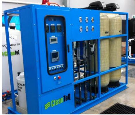
Figure 5: Reverse Osmosis Module