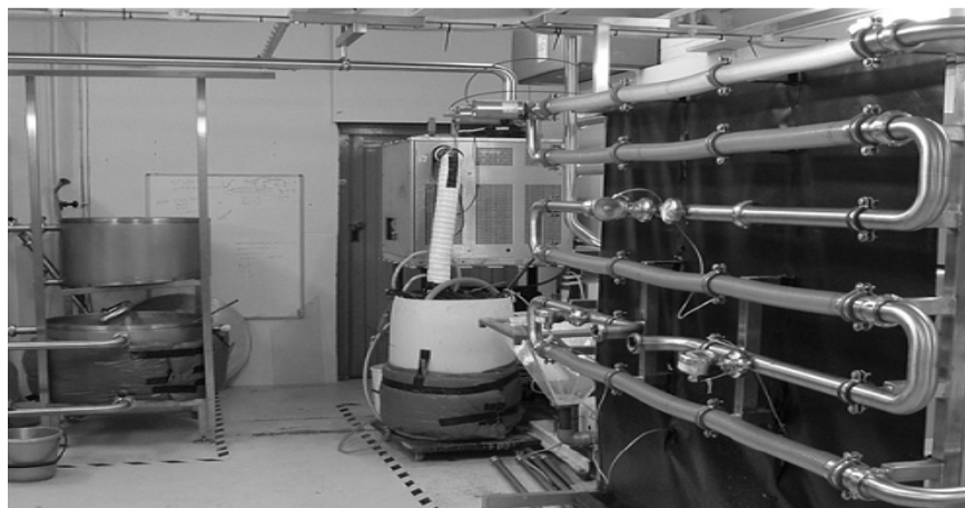
Figure 1: Ice pigging test facility at Bristol University

Put simply the major benefit seen in ice slurries are their ability to be pumpable, behaving like a liquid; and yet in pipelines, they behave as a solid thus increasing the shear stress on the pipe wall to successfully clean the internal lining of water mains.