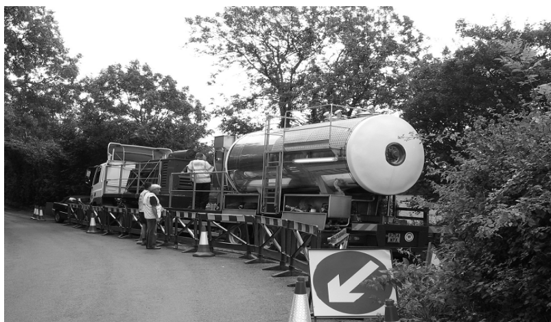
Figure 2: The ice delivery truck onsite ready to begin pigging

Once the theory of ice pigging was proven in the testing facility and a number of field-based trials were successfully carried out, a vehicle was constructed in Bristol to carry out ice pigging on a larger scale (see Figure 2). The vehicle itself consists of a large articulated truck used to carry a diesel generator, ice delivery pump and a geared stirrer. The stirrer is comprised of a stainless steel cylinder with a stirring device fitted to maintain the ice at the correct consistency as it is transported to site. The ice itself is produced by specialist ice making machines and pumped into the storage container for transport