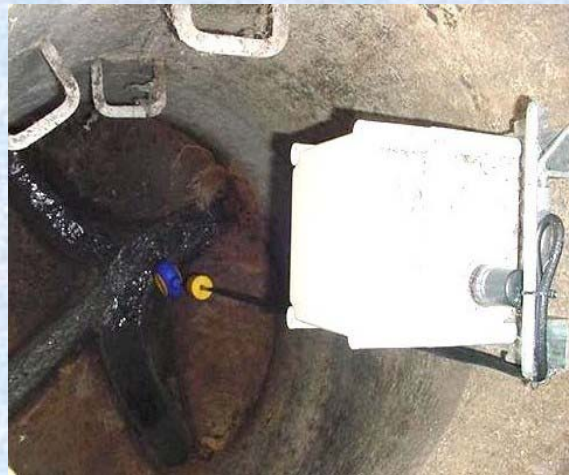
[ BLOK-AID unit being installed in an existing manhole ]