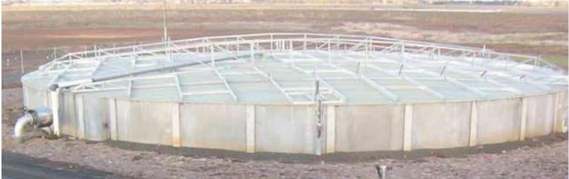
Figure 3: Flow Equalisation Tank

It was found that a detention time of approx 6 hrs (or 70% of tank capacity) was required to achieve the desired pre-acidification. Pre-acidification is determined by measuring the VFA's to COD ratio.