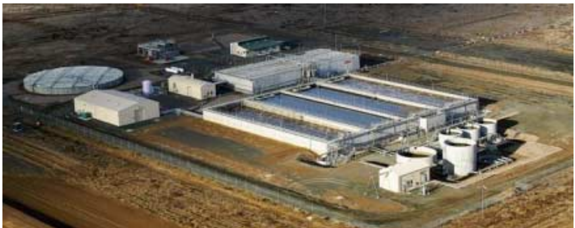
Figure 2: Echuca Wastewater Treatment Plant