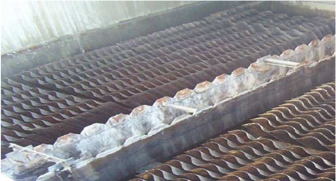
Figure 5: View of Separators

A 3-phase separator device at the top of the chamber effects the separation of the clarified wastewater, biogas and sludge.