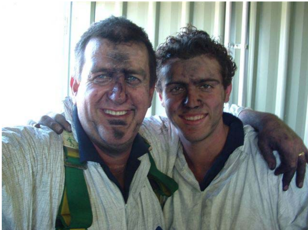
Figure 2: Dealing with anthracite is a dirty job

A trial with a 50mm vacuum unit proved unsuccessful due to not being able to keep enough water supply to the pump. There was insufficient head on the filter to push the water through the media fast enough.