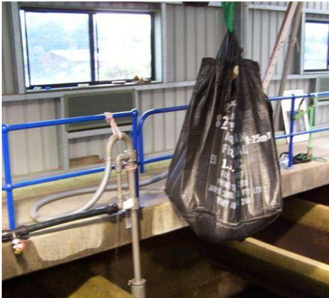
Figure 4: Hydro De Wetter unit discharging anthracite from bulky bag