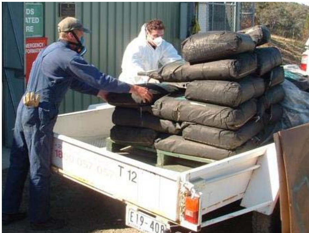
Figure 1: Manual handling of bagged anthracite