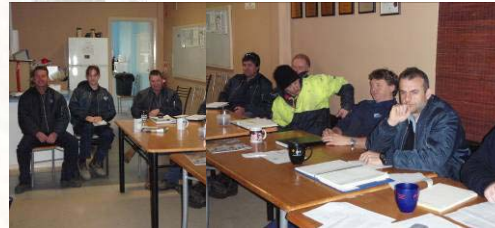
Schematic of new plant

Previously the Girgarre water treatment process was based on some chemical addition (PAC) and disinfection only, as per the schematic drawing below