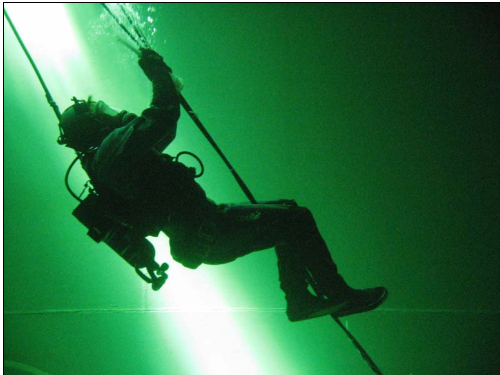
Figure 4: Diver secures control tables to the stainless steel guide wire using zip ties.

Once the flow meter unit is in position and bolted to the inlet or outlet penetration, the supporting legs are fixed in place and drilled or epoxy fixed to the floor. The weight is then transferred from the lift bag to the legs. A stainless steel guide wire is run from the underwater control unit and up to the roof framing. This guide wire needs to be insulated at the attachment points in case of lightning strikes and the heavy duty marine cables are then fixed along the length using zip ties (Fig. 4). The cables are run to the control box where the connection procedure can be performed by a local qualified electrician, as it is not a specialist process.