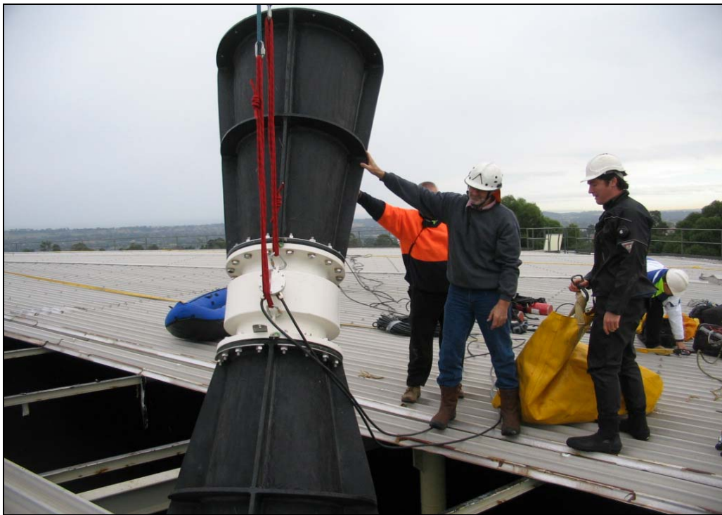
Figure 3: A partially completed flow meter unit being lowered through the roof of a reservoir. The diver prepares to connect a lift bag to assist in positioning the unit underwater. (Note: The tapered entry/exit HDPE pipe work)

Roof sheets had to be removed to allow the entry of some larger units (Fig. 3) but this proved to be more effective, particularly when water temperatures in winter months can be below 12°C and dive times have to be shortened.