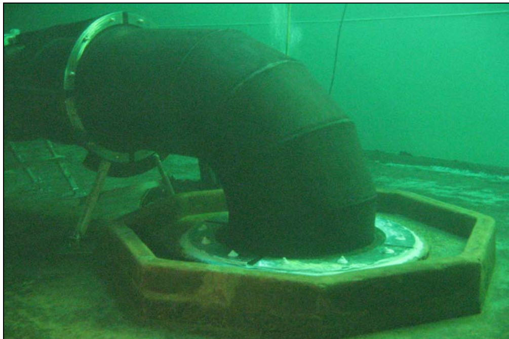
Figure 2: 90° HDPE Elbow used to accommodate an outlet penetration in the floor of a concrete reservoir.

Reservoirs can have a variety of inlets or outlets without flanges, so a mounting system has to be fixed prior to the main installation as shown in Figure 2.