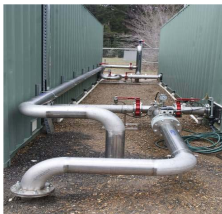
Figure 3: Stainless steel pipework, fabricated and installed on-site

Media (Anthracite) was craned onto site placing a 500mm layer in each of the 8 vessels and soaked. Installation of a raw water pump to existing infrastructure was carried out, as well as a static mixer and relevant dosing points.