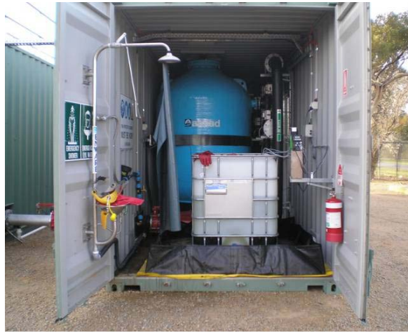
Figure 1: Filter & chemical storage within a container

During this drought period, the North East also experienced two significant bushfire events, both affecting the Ovens River Catchment. Since the 2006/07 bushfires, the majority of subsequent rainfall has caused significant turbidity spikes in the Ovens River, particularly in the upper reaches.