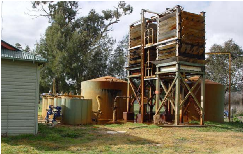
Figure 1: Tarcutta water treatment plant